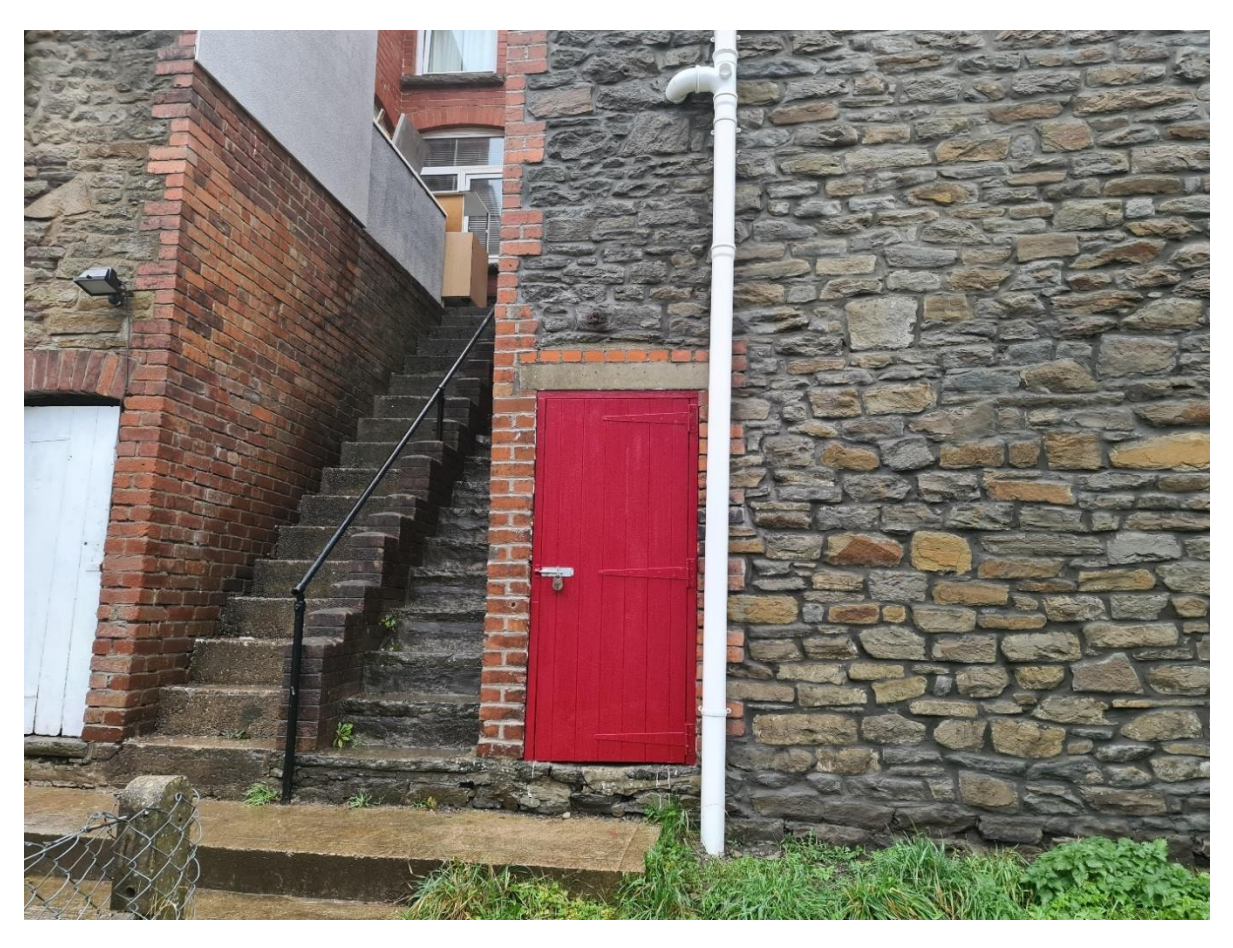
Example of Upper Steps