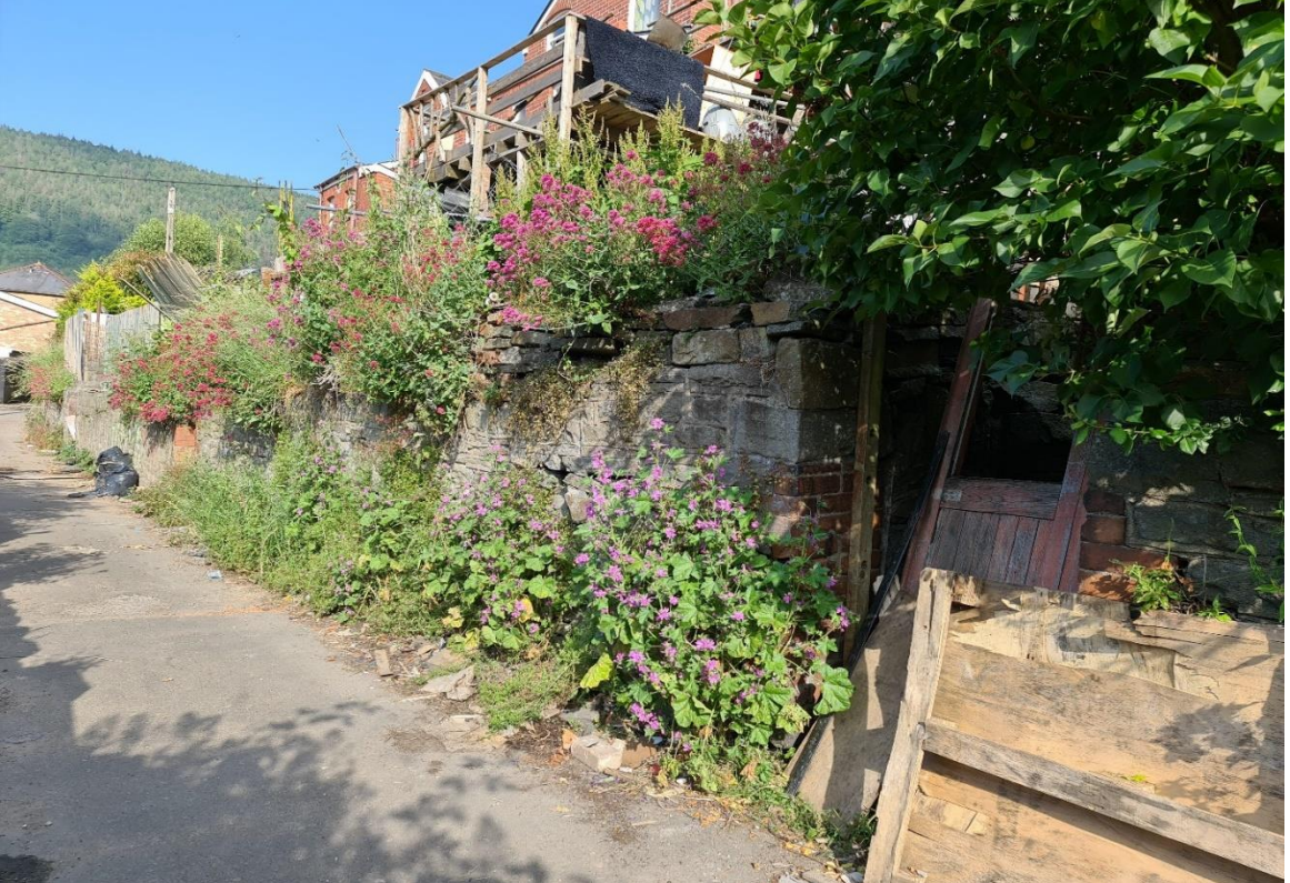
Examples of Rear Retaining Walls