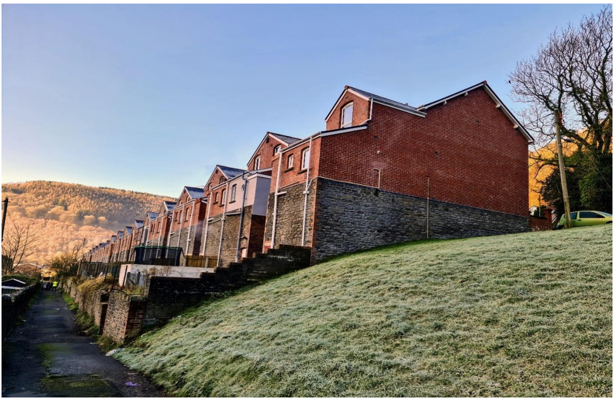
Rear Elevations of George Street.