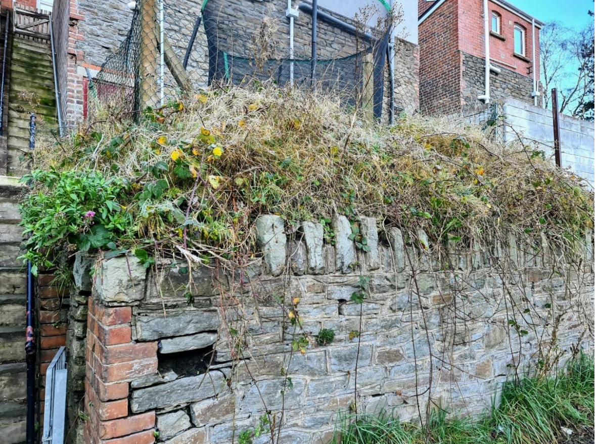
Examples of Rear Retaining Walls